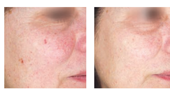
(Photos using polarized light)

Minisilk FT features a control tool that is extremely useful in daily practice. The integrated energy meter controls the real effectiveness of each individual pulse and the correct operation of the handpiece with a simple test. The creation of this instrument has made DEKA one of the few companies on the market that can guarantee the quantity and quality of the pulses. By allowing doctors and operators to control the effectiveness and correctness of the energy emitted, DEKA also offers the possibility of monitoring the duration and operation of the lamp over time. Medical studios can thus avoid undue and uncontrolled expenditure: the power meter makes it possible to test the handpiece at all times, reducing costs and maximising the economic return on the investment.