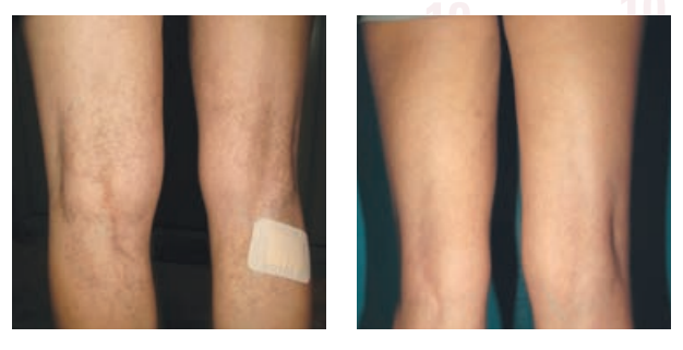
(Photos using polarized light)