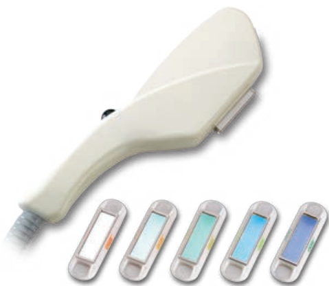
FT pulsed light handpiece with 5 interchangeable filters: A complete range of wavelengths at the physician's finger tips.

The FT pulsed light handpiece has a special interchangeable filter system. The physician can select the most suitable wavelength for the type of application or patient's phototype simply by replacing the filter without changing the handpiece. It takes only a few moments to prepare photorejuvenation and hair removal treatments.