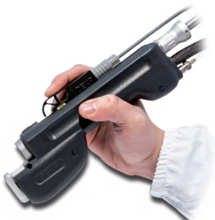
Laser handpieces with integrated skin cooling: Safer treatment and maximum patient comfort.