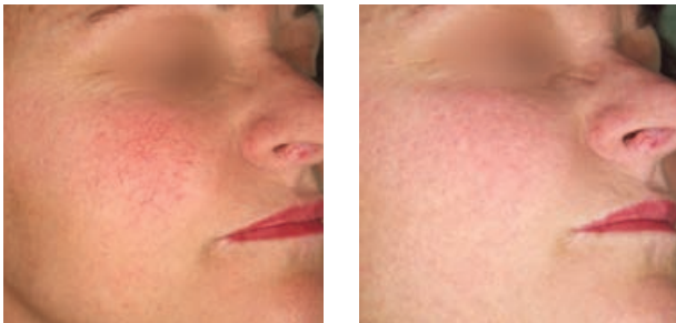
Nd:YAG Laser (Photos using polarized light)

DEKA has incorporated the Contact Skin Cooling technology into all its handpieces. Indispensable for the patient's well-being, this cools the skin using a completely new method. Treatments are practically painless and minimally invasive, and recovery times are short with no risk of side effects. Total comfort for the patient, maximum safety for the physician.