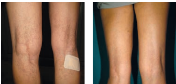
FT Pulsed Light Handpiece (Photos using polarized light)