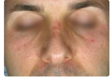
Rosacea treated with Viridis PL handpiece.