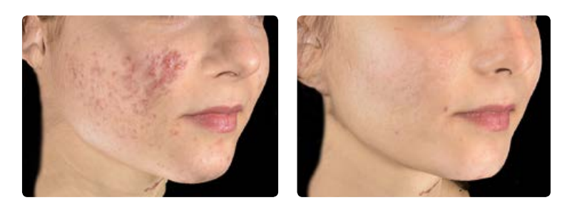
Active acne treated with Lazur PL handpiece. Photos taken using QUANTIFICARE 3D software .