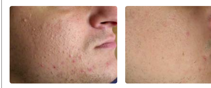
Acne scars treated with Insight Nd:YAP laser handpiece.