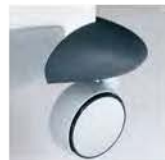
Castor with brake

Zimmer MedizinSystems Corp. 25 Mauchly, Suite 300 Irvine, CA 92618 Phone (800) 327-35 76 Fax (949) 727-21 54 info@zimmerusa.com www.zimmerusa.com