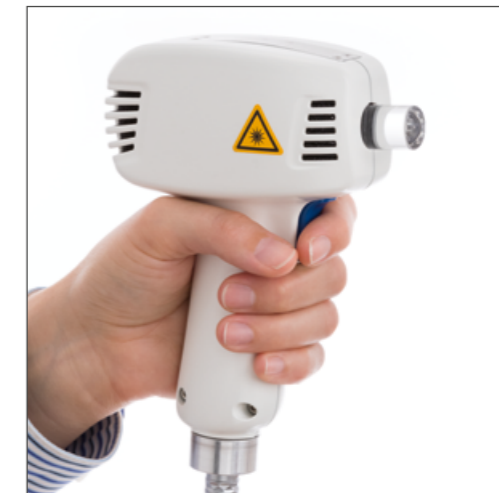
UVB EPL® lite 308 nm applicator