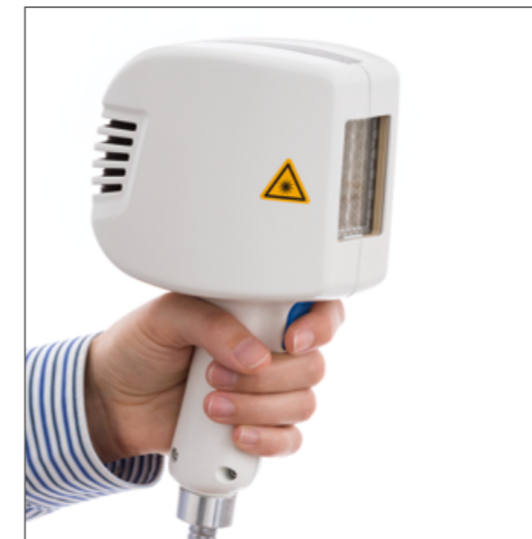
UVB EPL® 308 nm applicator